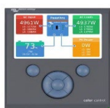
Color Control GX