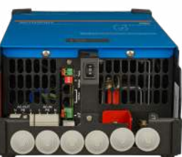
MultiPlus 2000 VA (bottom cover removed)