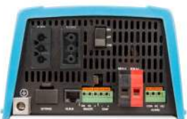
MultiPlus 500 / 800 / 1200 / 1600 VA