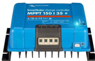
SmartSolar Charge Controller MPPT 150/35