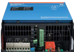
Connection Area MultiPlus-II 4k5